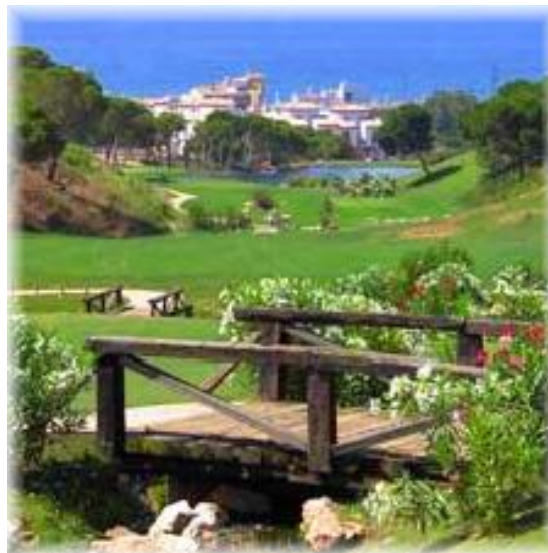
18 Las Mozas, Benahavis, Costa Del Sol