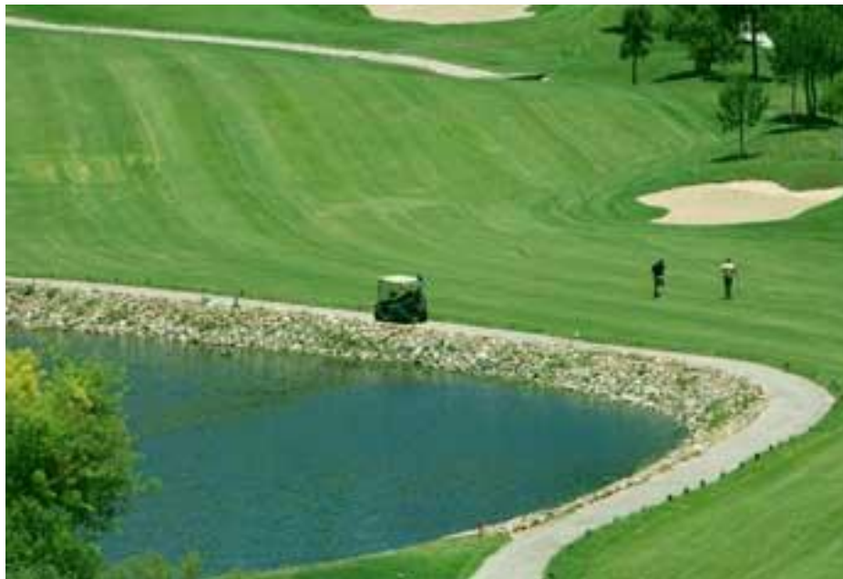
18 Las Mozas, Benahavis, Costa Del Sol