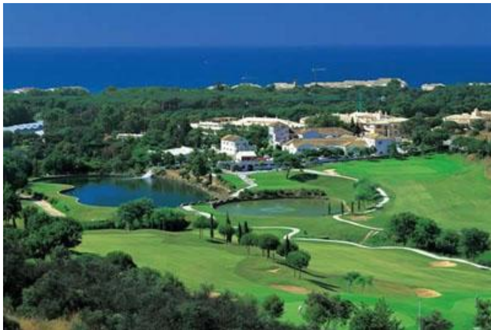
18 Las Mozas, Benahavis, Costa Del Sol